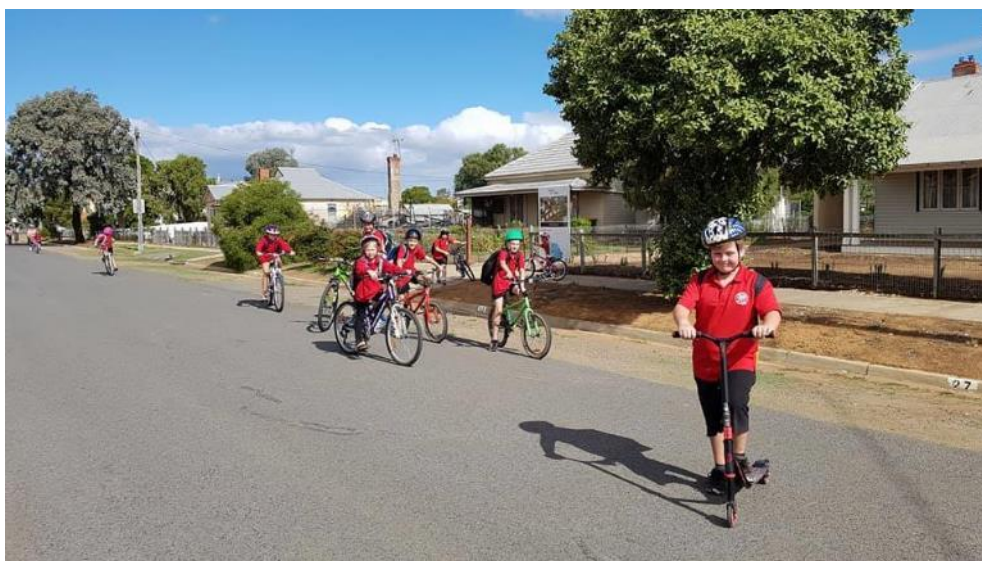
Prep-2 have a little ride down Eldon

Strava record of Grades 3 – 6's ride along the Loddon River – 8.5 km, well done and what fun!